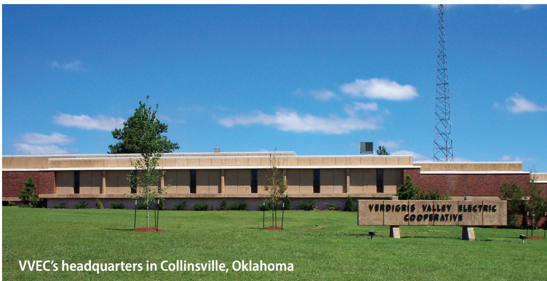
VVEC's headquarters in Collinsville, Oklahoma

5 Beyond adding visual appeal to your home, area rugs can also provide extra insulation and a warm surface for your feet on cold winter days. Use large area rugs in rooms where you spend the most time. You'll enjoy the new colors and textures of the rug, and the additional warmth will help keep your home comfortable. ■