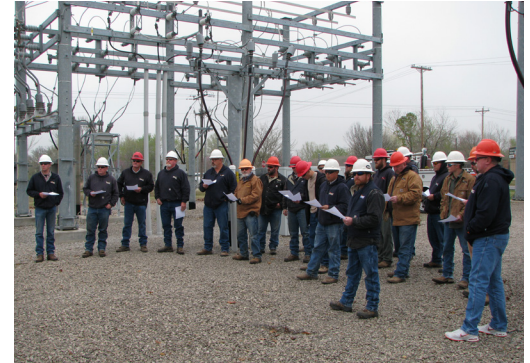
VVEC linemen participate regularly in safety trainings as part of our co-op's culture of safety.

It is no accident that safety is a top priority at VVEC. We are committed to a culture of safety that is integral to our daily operations. In fact, VVEC is part of the Rural Electric Safety Achievement Program (RESAP) that follows specific guidelines and protocols for electrical safety that are considered leading practices. (Read more about RESAP in this month's edition of Oklahoma Living .) Our lineworkers