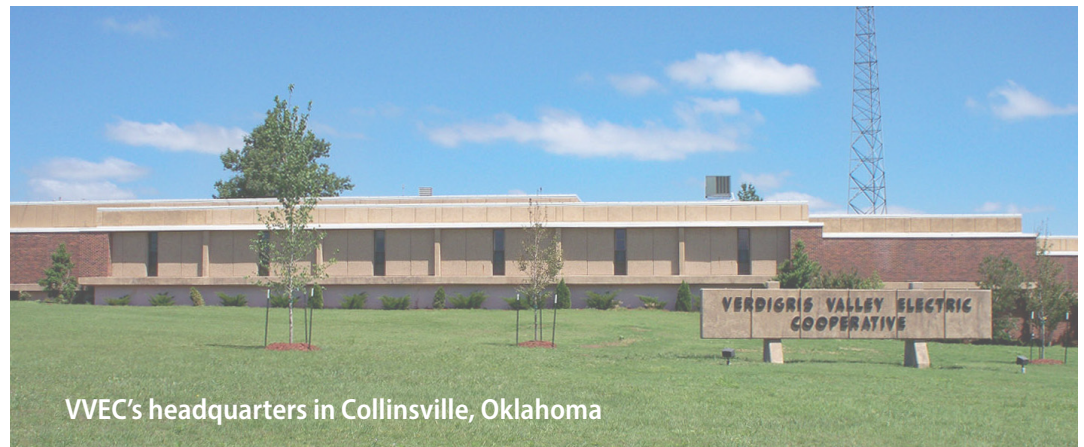
VVEC's headquarters in Collinsville, Oklahoma

This month, take a moment to plug into safety. Visit www.esfi.org for tips on how to keep you and your loved ones safe. ■