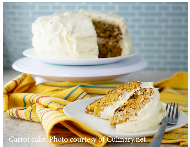
Carrot cake.