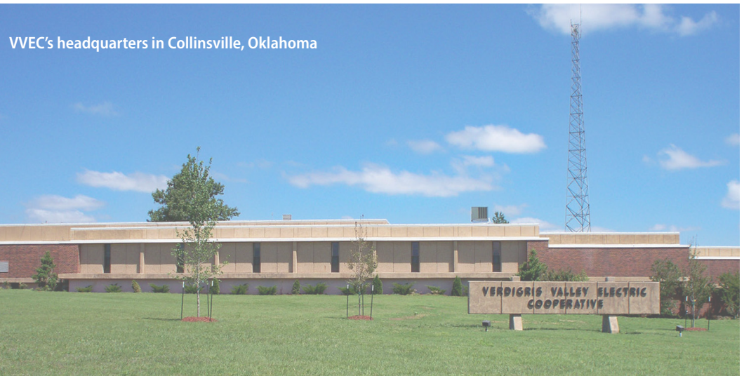
VVEC's headquarters in Collinsville, Oklahoma

If you are an official delegate to one of this year's district meetings, you must complete the above certificate and submit it at the meeting in order to cast a ballot for your organization.