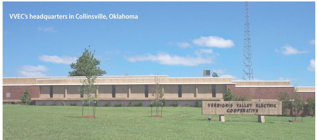
VVEC's headquarters in Collinsville, Oklahoma