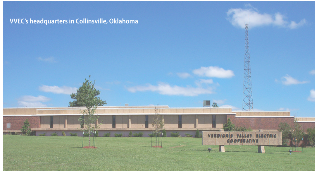
VVEC's headquarters in Collinsville, Oklahoma

In August, brush crews will be working in the orange shaded areas near the N. Bartlesville and Elm Creek Substations.