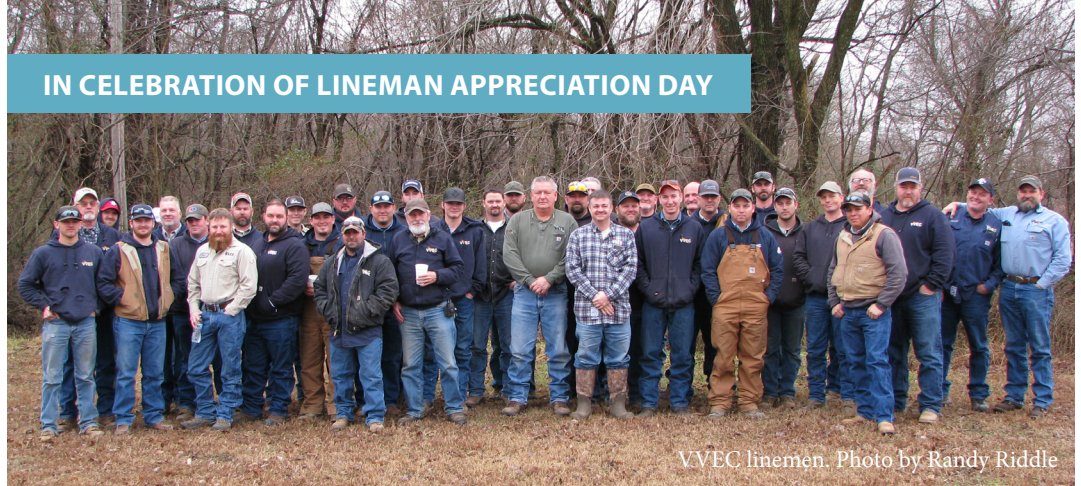
VVEC linemen.