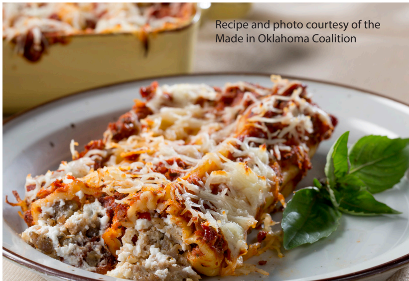
Recipe and photo courtesy of the Made in Oklahoma Coalition