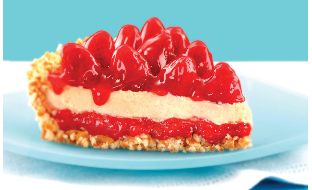
Strawberry Peanut Butter Pie. Recipe and photo courtesy of luckyleaf.com