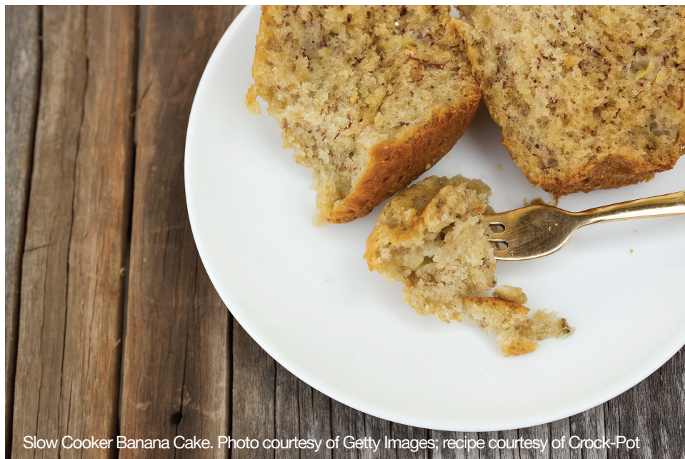
Slow Cooker Banana Cake. recipe courtesy of Crock-Pot

In large bowl, use mixer to cream butter and honey. Add