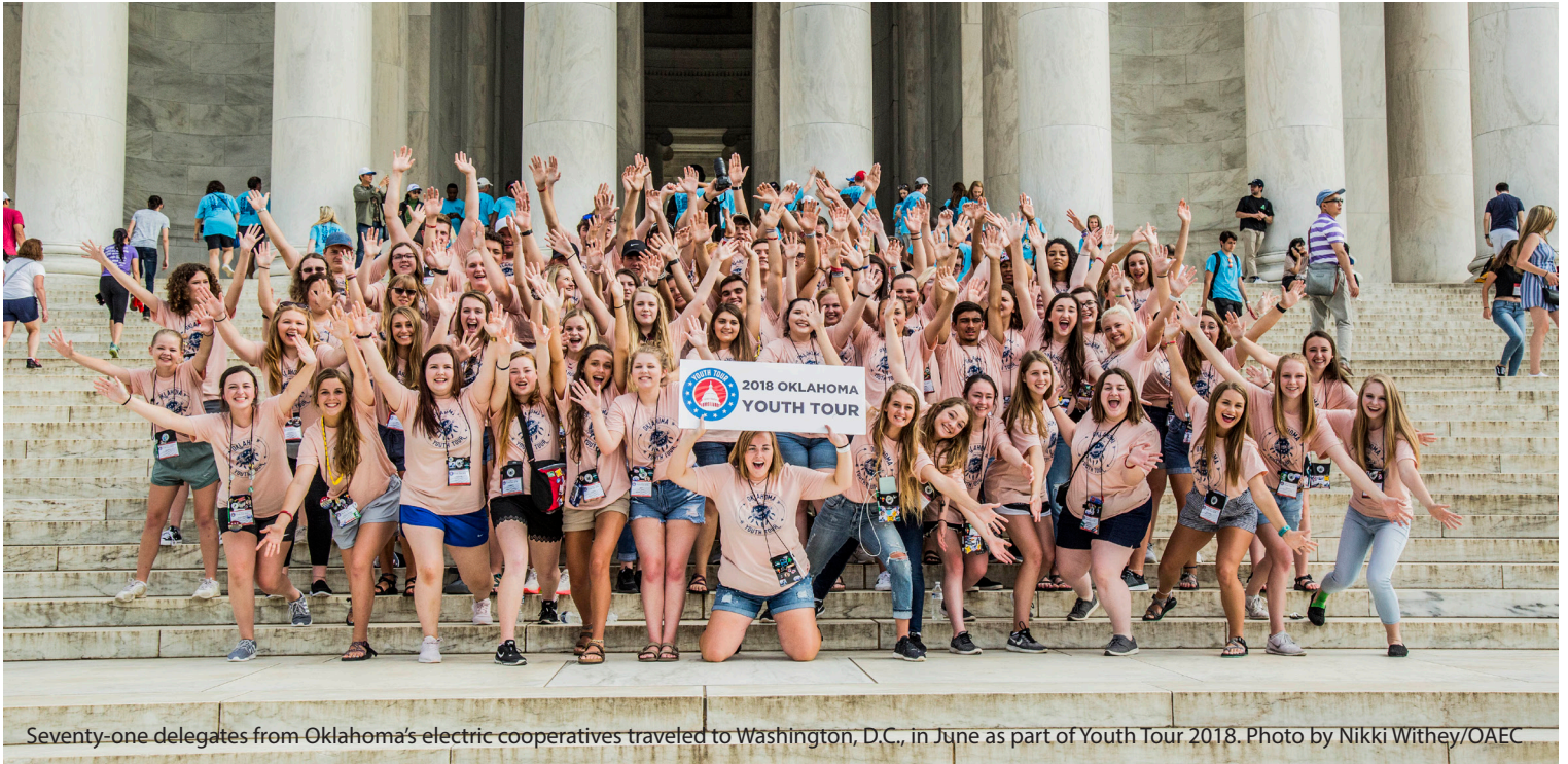
Seventy-one delegates from Oklahoma's electric cooperatives traveled to Washington, D.C., in June as part of Youth Tour 2018.