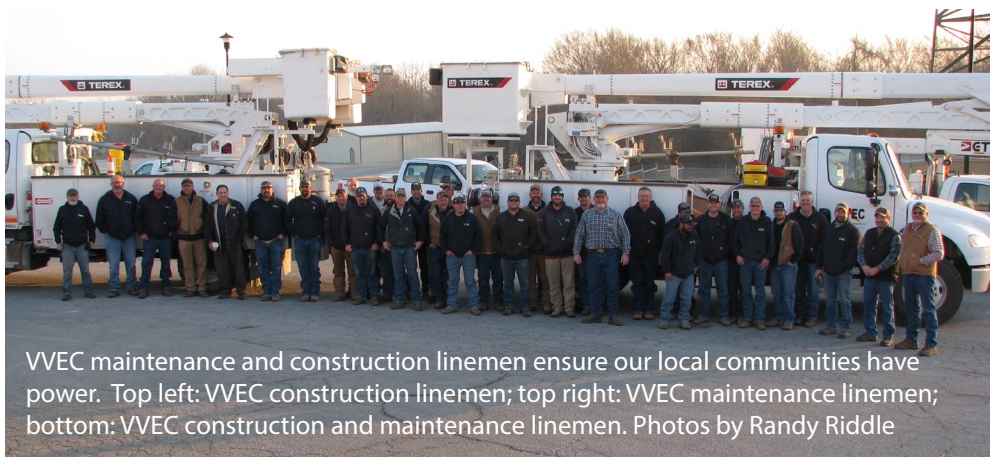
VVEC maintenance and construction linemen ensure our local communities have power. Top left: VVEC construction linemen; top right: VVEC maintenance linemen; bottom: VVEC construction and maintenance linemen.

“ No matter the time —day or night, weekday or weekend—if the lights go out, so do they. ”