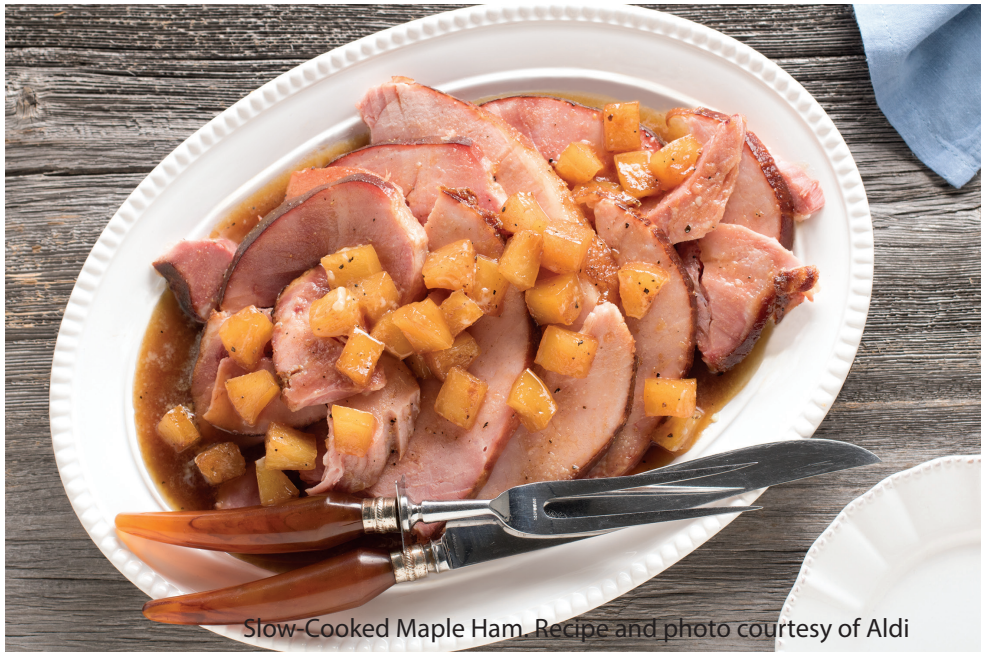
Slow-Cooked Maple Ham. Recipe and photo courtesy of Aldi

and bring to boil. Reduce heat to simmer; cook until reduced to desired consistency.