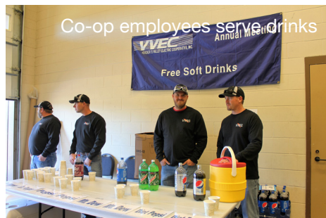
Co-op employees serve drinks