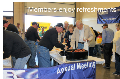
Members enjoy refreshments