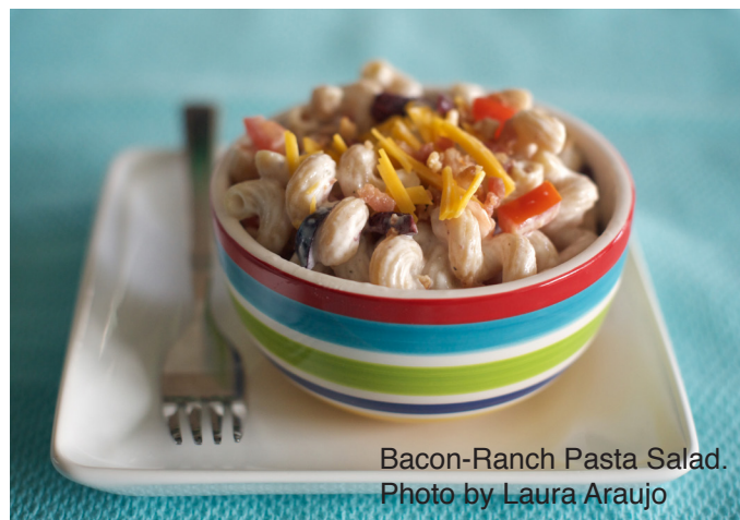
Bacon-Ranch Pasta Salad.