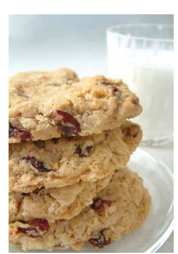
4 December 2011 WEC Power Circuit

If you have questions about our rebate programs, heat pumps or other energy-efficient appliances, please call our member services department at (918) 371-2584, Monday through Friday, 7:30 a.m. to 4 p.m.