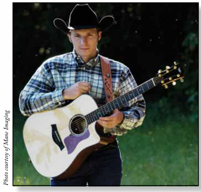
Popular Country Entertainer Paul Bogart